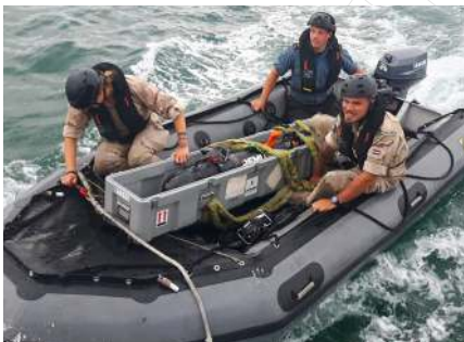
Royal Canadian Navy members train with a Royal Netherlands Navy autonomous underwater vehicle team during the Rim of the Pacific (RIMPAC) exercise.