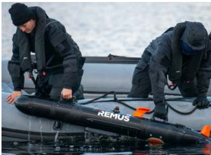
Dutch Navy REMUS Team recovers the Autonomous Underwater Vehicle during Trident Juncture 18.

The open architecture and modularity of the REMUS Technology Platform facilitates increased capabilities, interoperability and applications while decreasing risk and cost.