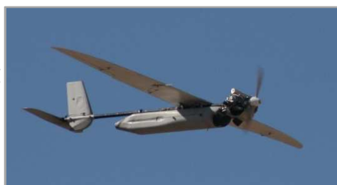
Fixed Wing UAV