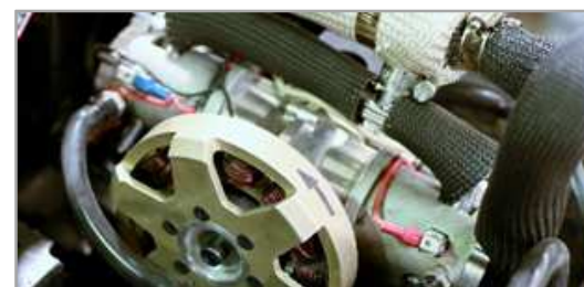
Marine Hybrid with Water Cooling